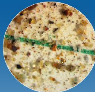
ISO CODE: 28/26/21